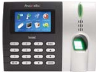
TA102C / TA103C