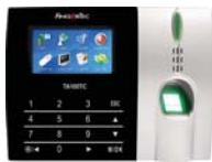
TA102TC / TA103TC